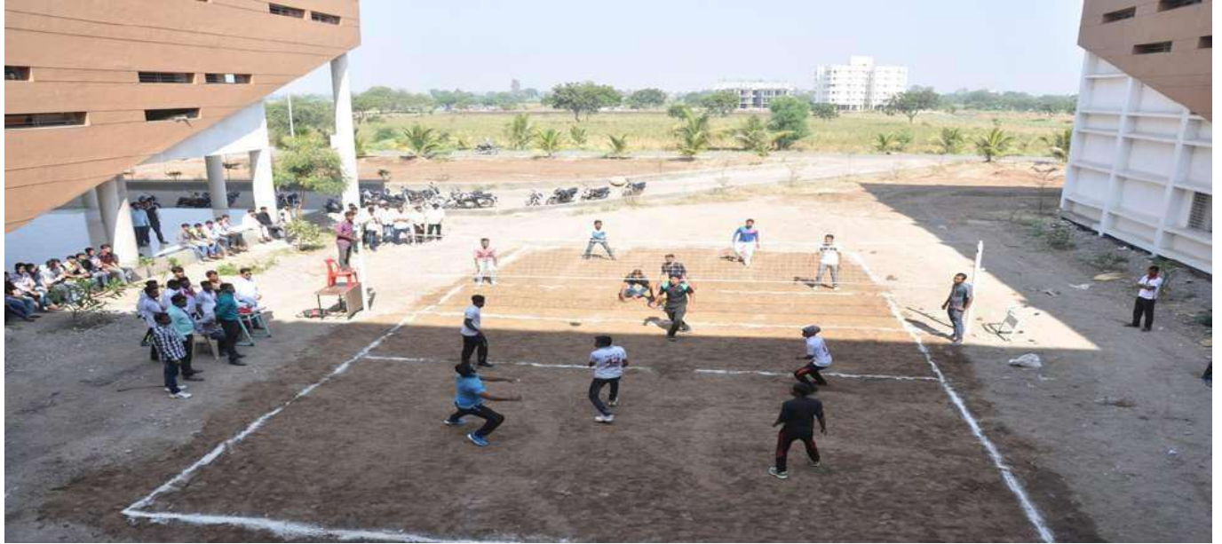
ANNUAL SPORTS MEET VOLLEYBALL EVENT

Approved by AICTE, MS (New-Int)-Engg./2009/09, Dt. 15/06/09, Affiliated to Savitribai Phule Pune University