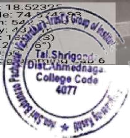
PROGRAMMING LAB 6 PRINCIPAL H.S.B.P.V.T.'S GROUP OF INSTITUTION'S PARIKRAMA COE KASHTI