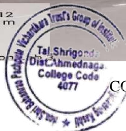
COMMUNICATION LAB 3

PRINCIPAL H.S.B.P.V.T.'S GROUP OF INSTITUTION'S PARIKRAMA COE KASHTI