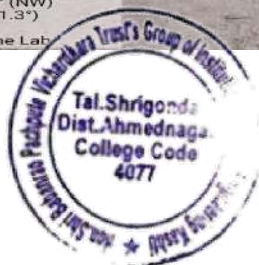
IC ENGINE LAB

Watef PRINCIPAL H.S.B.P.V.T.'S GROUP OF INSTITUTION'S PARIKRAMA COE KASHTI