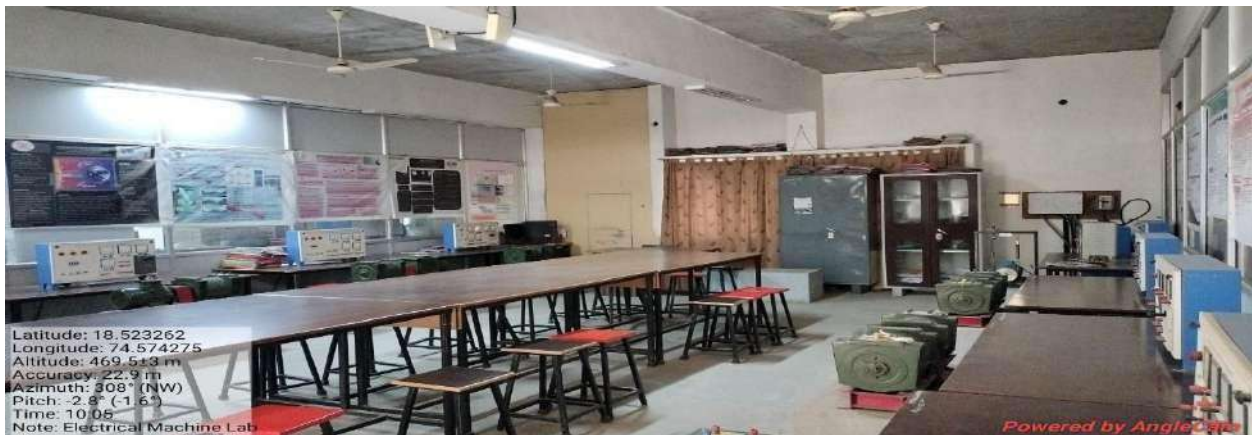
ELECTRICAL POWER SYSTEM LAB

Latitude: 18.523262 Longitude: 74.574275 Altitude: 469.5±3 m Accuracy: 22.9 m Azimuth: 308° (NW) Pitch: 2.8° (-1.6°) Time: 10:05 Note: Electrical Machine Lab