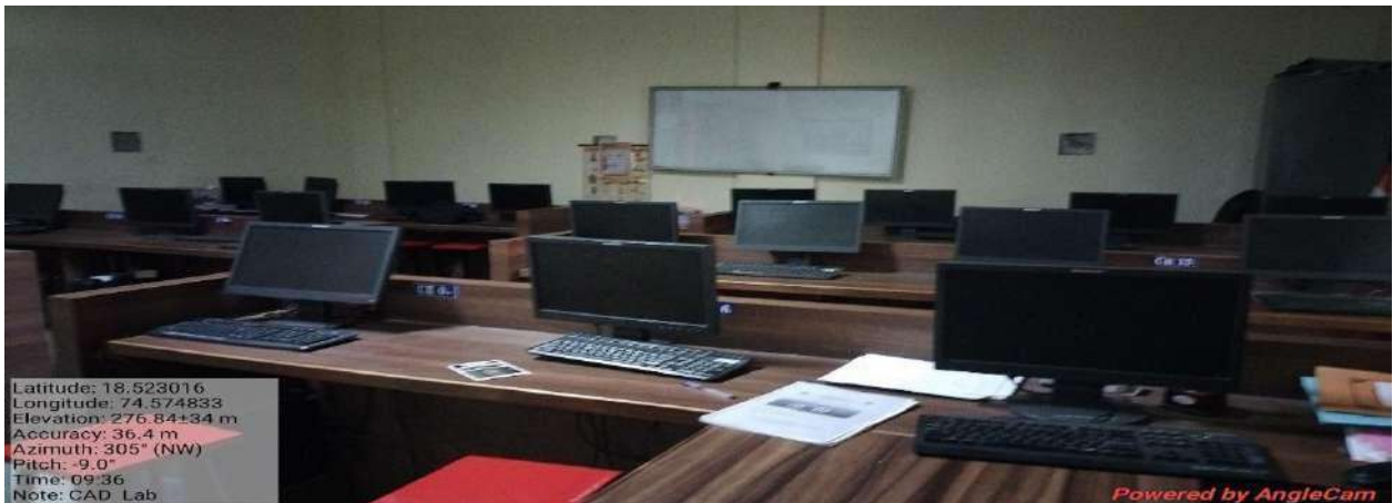
ENVIRONMENTAL ENGINEERING LAB

Latitude: 18.523016 Longitude: 74.574833 Elevation: 276.84±34 m Accuracy: 36.4 m Azimuth: 305° (NW) Pitch: -9.0° Time: 09:36 Note: CAD Lab