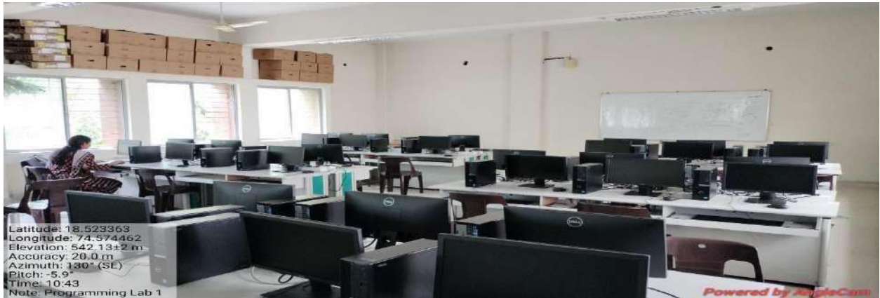
PROGRAMMING LAB 1