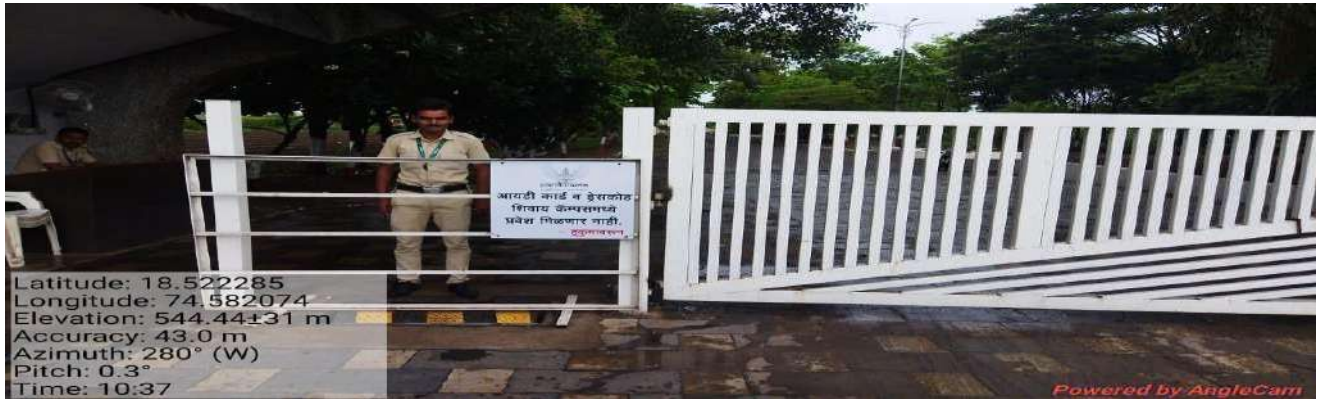
Parikrama Gate with Security

Approved by AICTE, MS (New-Int)-Engg./2009/09, Dt. 15/06/09, Affiliated to Savitribai Phule Pune University