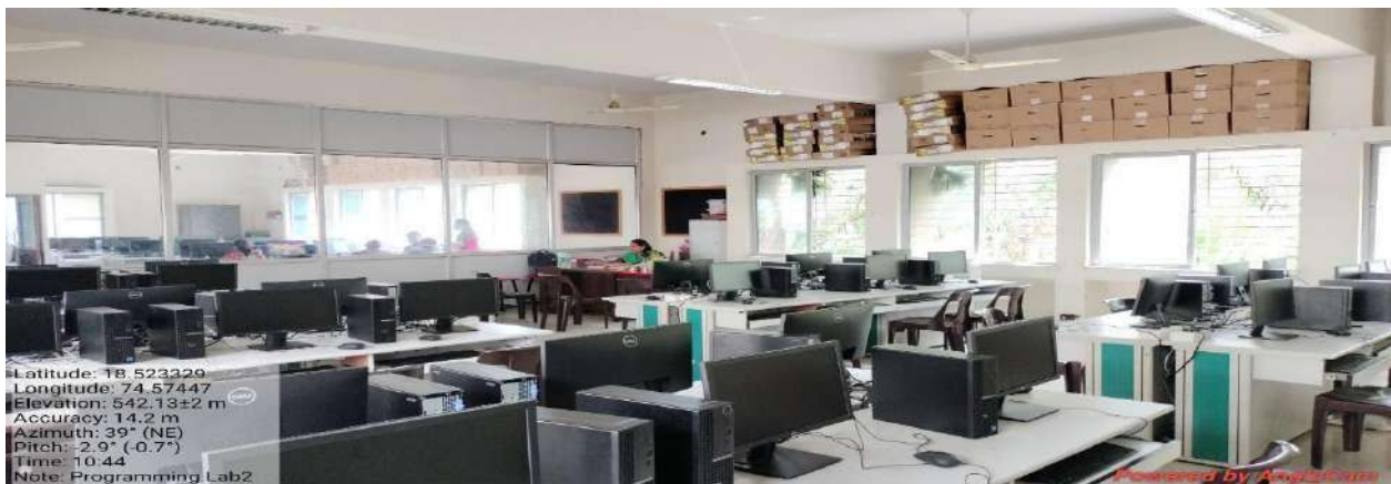
PROGRAMMING LAB 2