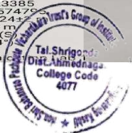
COMMUNICATION LAB 3

PRINCIPAL H.S.B.P.V.T.'S GROUP OF INSTITUTION'S PARIKRAMA COE KASHTI