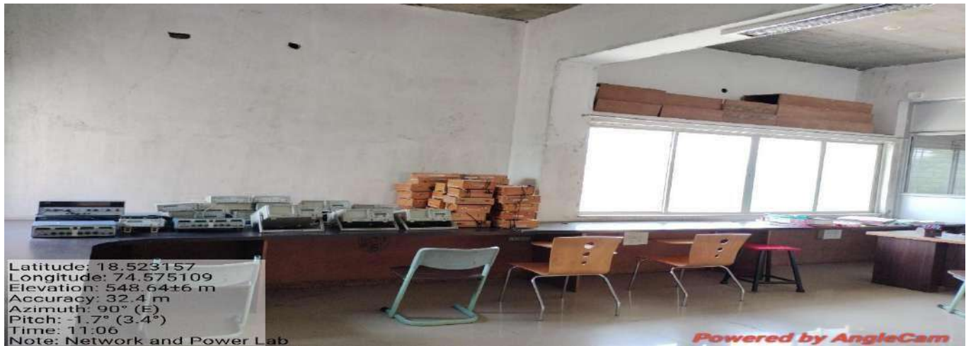
NETWORK & POWER LAB

Approved by AICTE, MS (New-Int)-Engg./2009/09, Dt. 15/06/09, Affiliated to Savitribai Phule Pune University