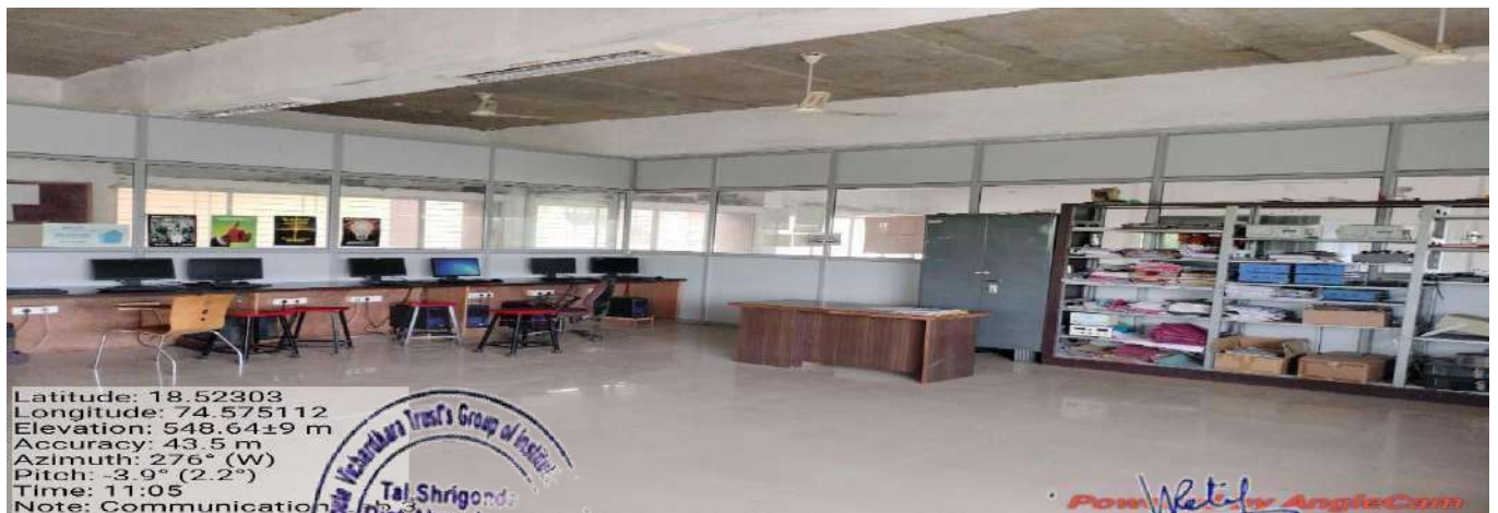
EMBEDDED & IOT LAB

Latitude: 18.52303 Longitude: 74.575112 Elevation: 548.64±9 m Accuracy: 43.5 m Azimuth: 276° (W) Pitch: -3.9° (2.2°) Time: 11:05 Note: Communication