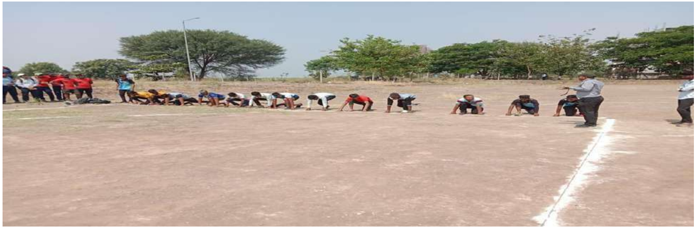
ATHELETICS EVENT COMPETITION

Approved by AICTE, MS (New-Int)-Engg./2009/09, Dt. 15/06/09, Affiliated to Savitribai Phule Pune University