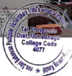
HEAT TRANSFER LAB

PRINCIPAL H.S.B.P.V.T.'S GROUP OF INSTITUTION'S PARIKRAMA COE KASHTI