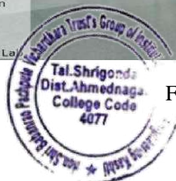
FLUID MECHANICS LAB