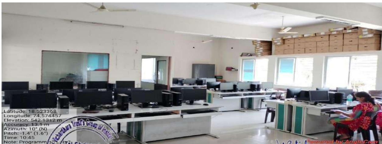
PROGRAMMING LAB 3