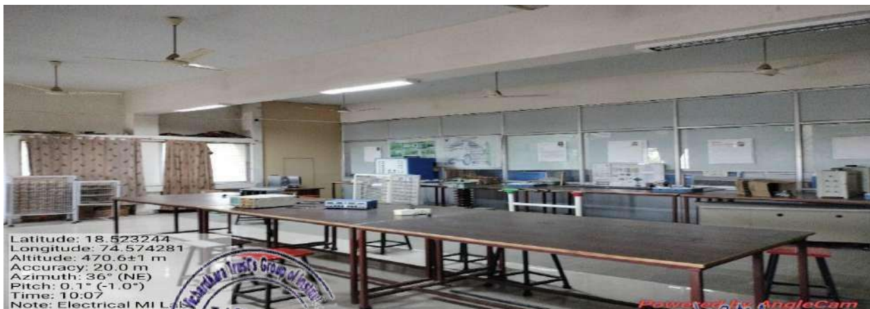
ELECTRICAL MACHINE LAB

Latitude: 18.523244 Longitude: 74.574281 Altitude: 470.6±1 m Accuracy: 20.0 m Azimuth: 36° (NE) Pitch: 0.1° (-1.0°) Time: 10:07 Note: Electrical MI Lab