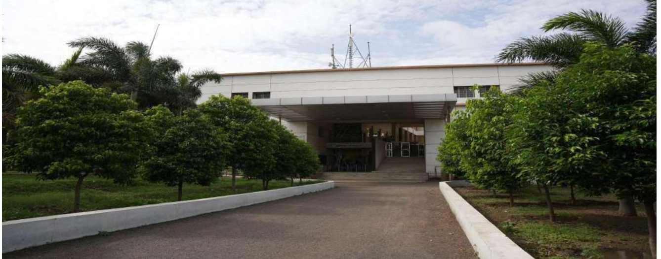
ENGG. BUILDING ENTRANCE

Approved by AICTE, MS (New-Int)-Engg./2009/09, Dt. 15/06/09, Affiliated to Savitribai Phule Pune University